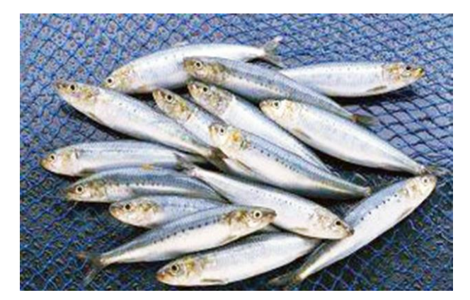
Figure 1. Sardinella melanura which were caught from Persian Gulf.

cal, microbial and nutrient profile of Mahvieh, a fermented product from Hashineh or Mooto fish.