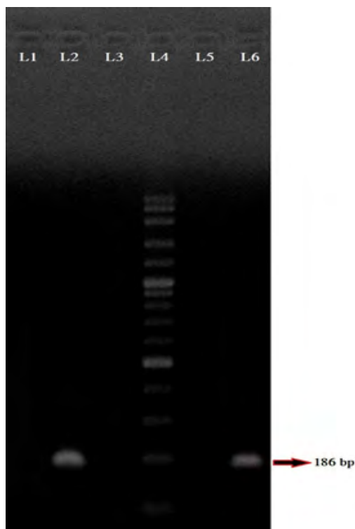
Figure 1. Agarose gel electrophoresis of PCR products from PCR assays using tuf gene-based primer set.

L1: Negative control. L2: Genomic DNA directly extracted from probiotic yoghurt. L3: L. delbrueckii subsp. bulgaricus genomic DNA. L4: DNA ladder marker (100 bp). L5: L. acidophilus LA-5 genomic DNA. L6: B. animalis subsp. lactis BB-12 genomic DNA.