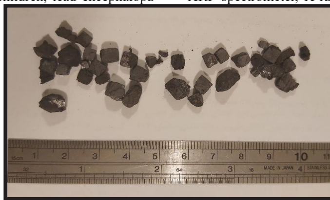
Figure 1. A sample of ithmid stone purchased from Shiraz, Iran.

Three samples of ithmid (Figure 1) were purchased from the local market of Tehran (S T ), Kerman (S K ), and Shiraz (S SH ). They were deposited with the Voucher Nr. PM1300, PM1302, and PM1298 in Traditional Pharmacy department, Faculty of Pharmacy, Shiraz University of Medical Sciences. The samples were kept in a plastic bag in a cool and dry place away from sunlight and fumes before analysis procedures that were conducted in Mashhad analytical Geology Lab East Amethyst. The stones were ground to fine powders and then they were mounted in sample cups. To identify the composition of ithmid , each sample was subjected to X-ray studies employing Philips PW 1480 XRF spectrometer (UniQuant-software) linked to X40 software and minerals database. In XRF spectrometer, X-rays were generated in an