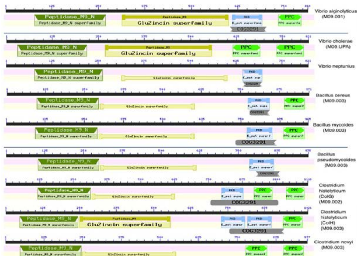
Figure 3. The different domains of collagenase in various species of Bacillus , Vibrio , and Clostridium . Domains depicted: peptidase_M9_N, representing peptidase family M9 N-terminal; this domain is found in microbial collagenase metalloproteases; peptidase_M9, Collagenase; this family of enzymes break down collagens; PKD, polycystic kidney disease I domain; similar to other cell-surface modules with an IG-like fold; PPC, bacterial pre-peptidase C-terminal domain; this domain is normally found at the C-terminus of enzyme.