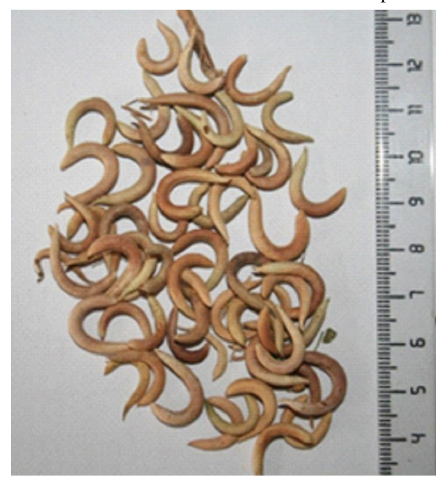
Figure 1. Dried ripped seedpods of A. hamosus (Iklil-ul-Malik or Nakhonak).

Fatty acids and sterols were identified by comparing the mass spectra and retention times obtained, with those of reference compounds, or with mass spectra in the literature. For those compounds for which neither standard compounds nor reference spectra were available, chemical structures were postulated according to the general patterns of mass spectrometric fragmentation of dif-